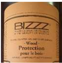
Bizz Polymerized Oil