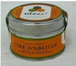
Bizzz™ Bees Wax

Tools and materials required to restore your Bizier countertop.